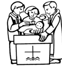
I baptize you in the name of the Father and of the Son and of the Holy Spirit

Sat. 26 Saint Joseph's Men's Club meeting at 8:30am